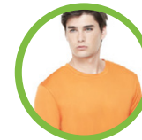
ALO Polyester Sport M1009