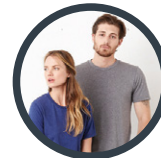
BELLA Triblend 3413