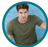
Gildan Softstyle 64000