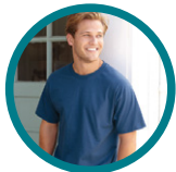
Hanes Tagless 5250