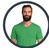
Allmade Triblend AL2014