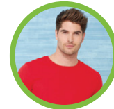
Gildan Performance 42000